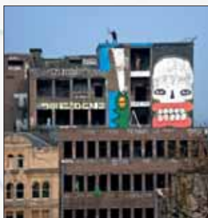
Cyclops, Rowdy & Sweet Toof - Street piece, Westmoreland House, Stokes Croft