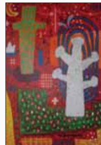
Masako Seo 'Deep Forest' woodcut 85 x 60cm