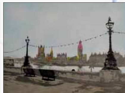
Nick Walker 'The Morning After - London'