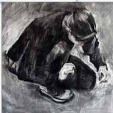
Marianne Seabright 'Self Portrait' 2008 charcoal on gesso vs graphite 93 x 99cm