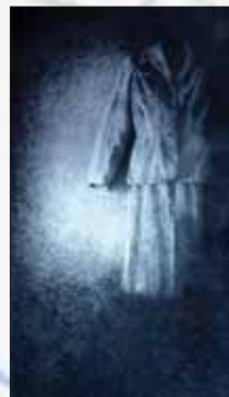
Ruth Wallace 'Untitled' (Suit 1) graphite on paper 173 x 99cm Courtesy of Bristol Drawing School