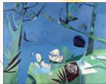
Simon Pooley 'Lamorna Wood' acrylic 96.5 x 122cm