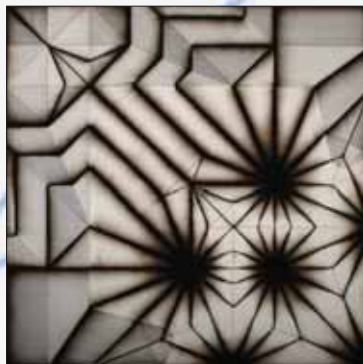
Rachael Nee RWA 'Bird Pattern II' 2007 smoke, graphite on laser cut board 106 x 106cm