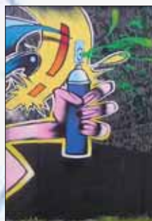
FLX 'I Must Not Write on Walls' Street piece, Riverside Park, 2007