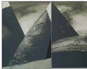
Alexander Kizilov 'Ragtime I' detail etching & aquatint 56 x 99.5cm