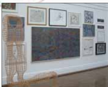
Work from a previous Autumn Exhibition