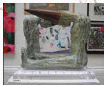
Bushra Fakhoury 'Harlequins' bronze