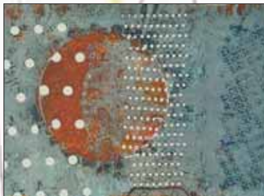
Peter Ford RWA 'Culinaria' detail collagraph 25 x 35cm