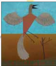
Peter Fox 'Archaeopteryx' oil, 38 x 33cm